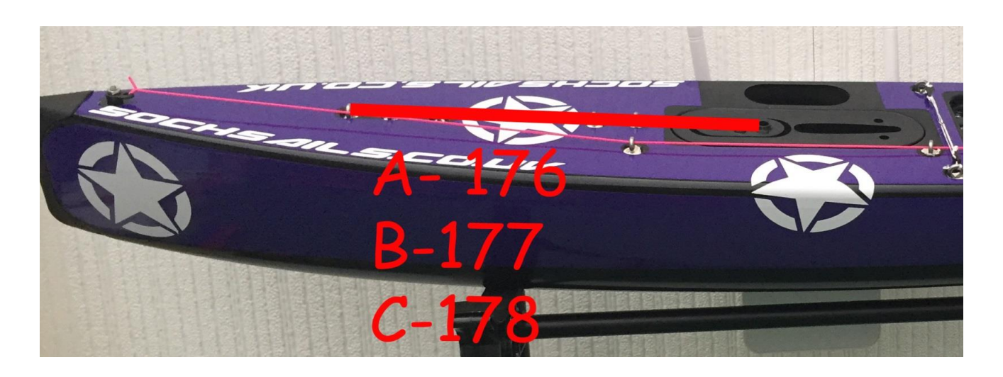
Fore & Aft Rake